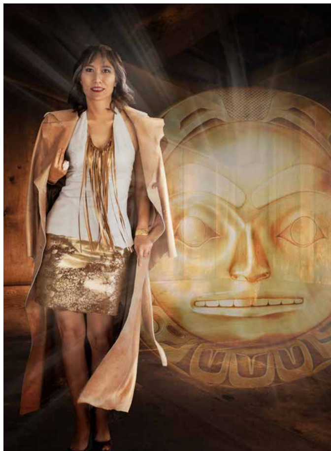
sGaanaGwa - WINTER SOLSTICE