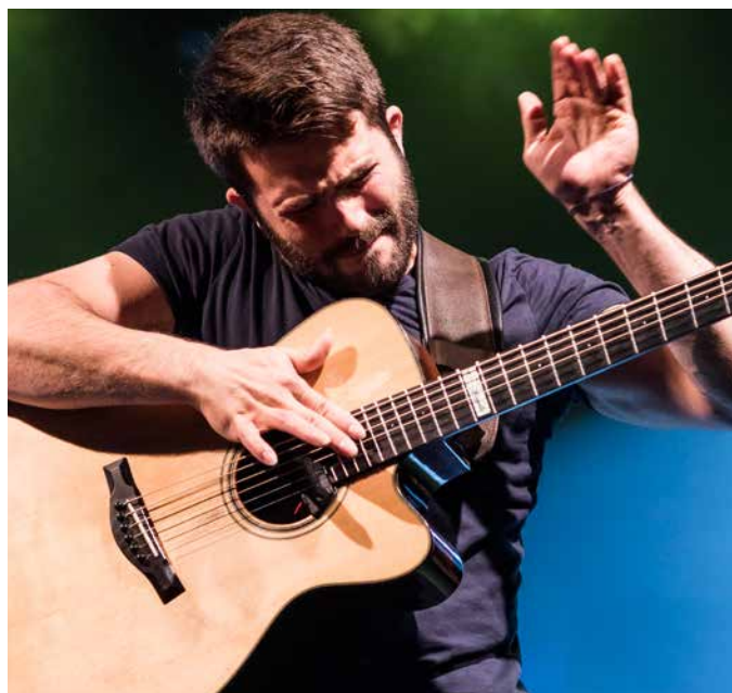
INTERNATIONAL GUITAR NIGHT