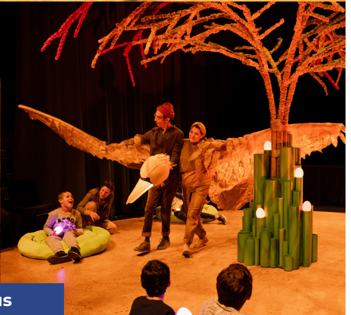
TREE: A World In Itself - Théâtre Motus