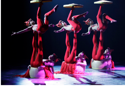
The National Acrobats of the People's Republic of China soared into The Port Theatre for 3 performances in September.

651189 BC Ltd. Airwest Heating & Gas Ltd. Andrea Noble Copywriting Audience Marketing Inc. Barbara Day Sort Law Corp. Bastion Law Group Canadian Sitter Inc. Cargo Bed International Inc. Cheriton Management Inc. Coastal Mountain Fuels Coombs Wooden Shoe Dutch Import Store Delicado's Ecstasy Audio Ethos Career Management Group Fuller Management Inc. Gina's Mexican Cafe Harbour Dancentre Harris Auto Group Heath & Co. Heather Tours