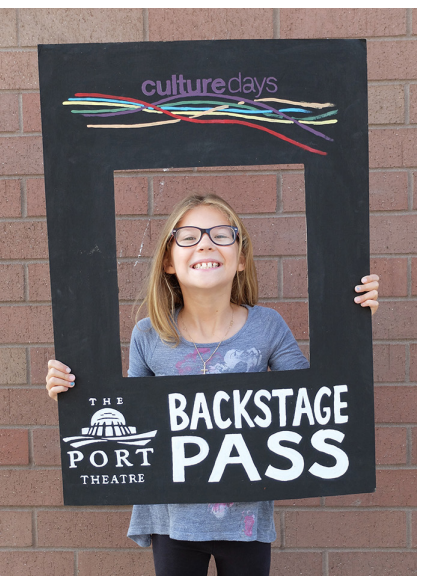
In September, The Port Theatre joined Culture Days with a special backstage open house, which drew in more than 60 people to see the behindthe-scenes of our theatre.

There were a total of 28 events equalling 57 performances held at other venues: Beban Park