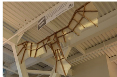
The Port Theatre teamed up with the VIU Visual Art Department and the Nanaimo Airport to create an aerial themed art display that also served as a teaser for The Port Theatre's 2015-16 Season.