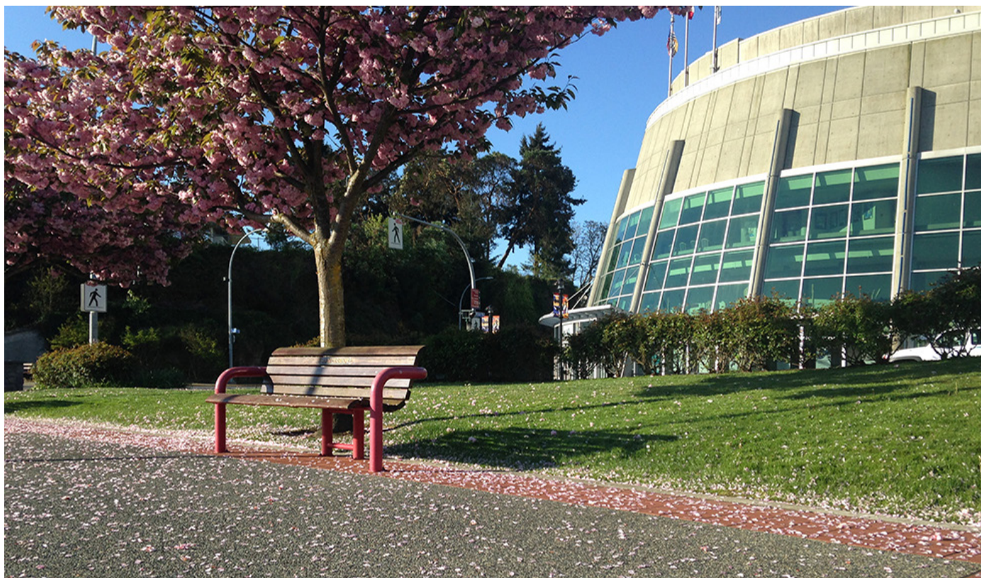
Across from The Port Theatre, Nanaimo's harbourfront walkway blooms each spring.