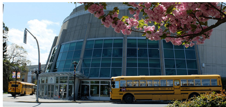
School District 68 elementary students enjoyed a free daytime performance thanks to the Schools on Stage program.

Every year, The Port Theatre Society is proud to partner with many community organizations and events. In 2015, we grew and developed a great number of these relationships. We would like to recognize some of these important partnerships to show how they have benefited our community.