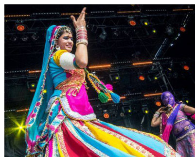
The Bollywood Masala Orchestra and Dancers of India performed 'Spirit of India' as part of the Spotlight Series in September 2015.

Association, Skaana Community Resources Ltd., Snuneymuxw First Nation, Society of Organized Services, SOS Seniors, Supportive Apartment Living, Tillicum Lelum Aboriginal Friendship Centre, Tillicum Lelum Men's Wellness Survivors, Vancouver Island Mental Health Society, Vancouver Island University- Clemente Course, Vancouver Island Vocational and Rehabilitation Services, VIHA Mental Health & Addiction Services, VIHA Youth & Family Addictions