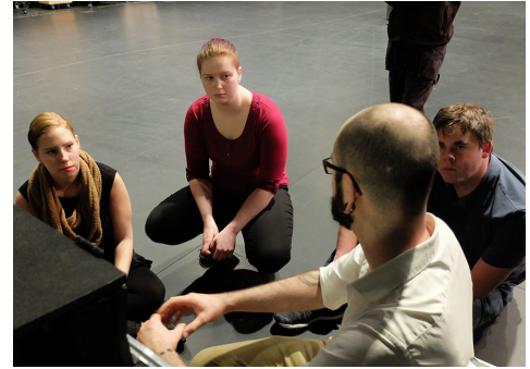
Youth Arts Initiative participants learned what happens on stage and behind-the-scenes during two workshops with Port Theatre technicians.

Student Work Experience provides opportunities for VIU Technical Theatre students to shadow our professional technicians; the Windows of Opportunity program provides schools in Nanaimo and Ladysmith with professional development days for at-risk students; Schools on Stage gives elementary students access to the theatre and staff for a full day to put on large-scale community performances; and EyeGO to the Arts gives secondary school students a chance to experience live theatre, music and dance for only $5 per ticket.