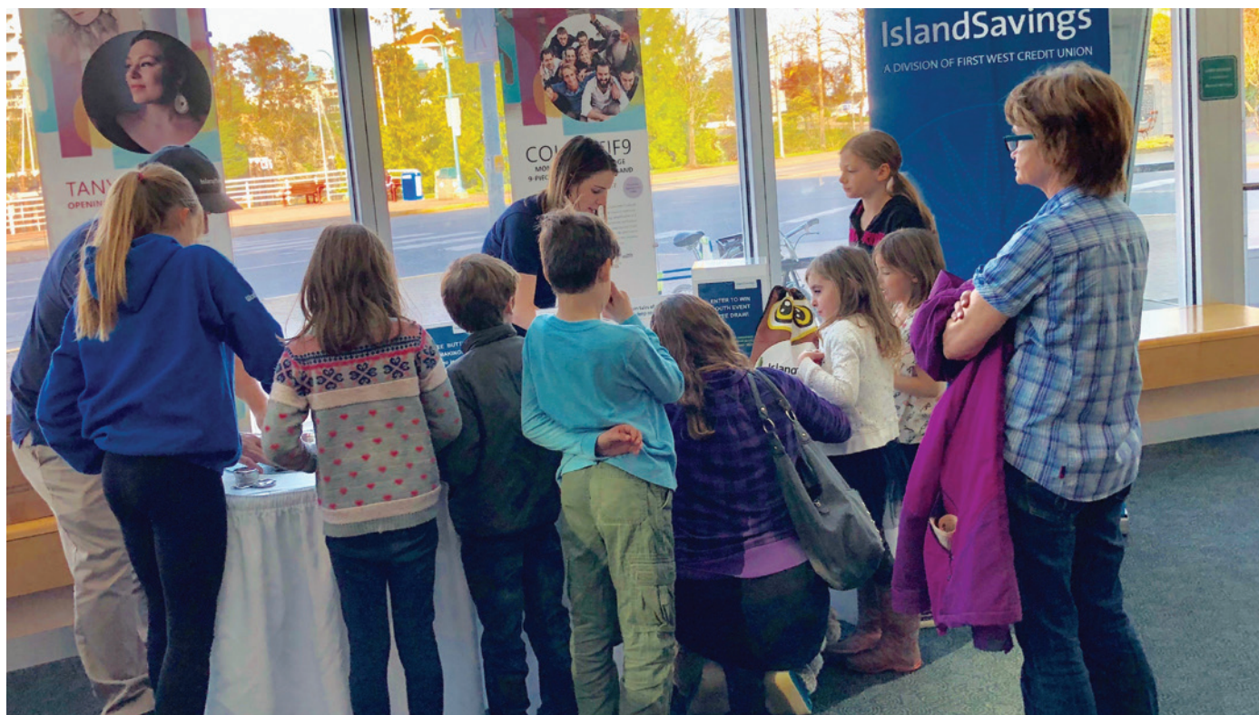
Youth enjoy lobby activities before Little Orange Man in April.