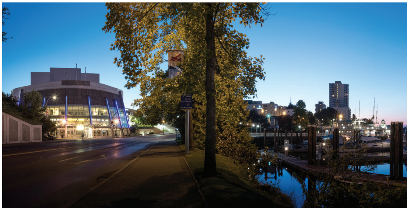
The Port Theatre celebrates 20 years of community support & community impact!