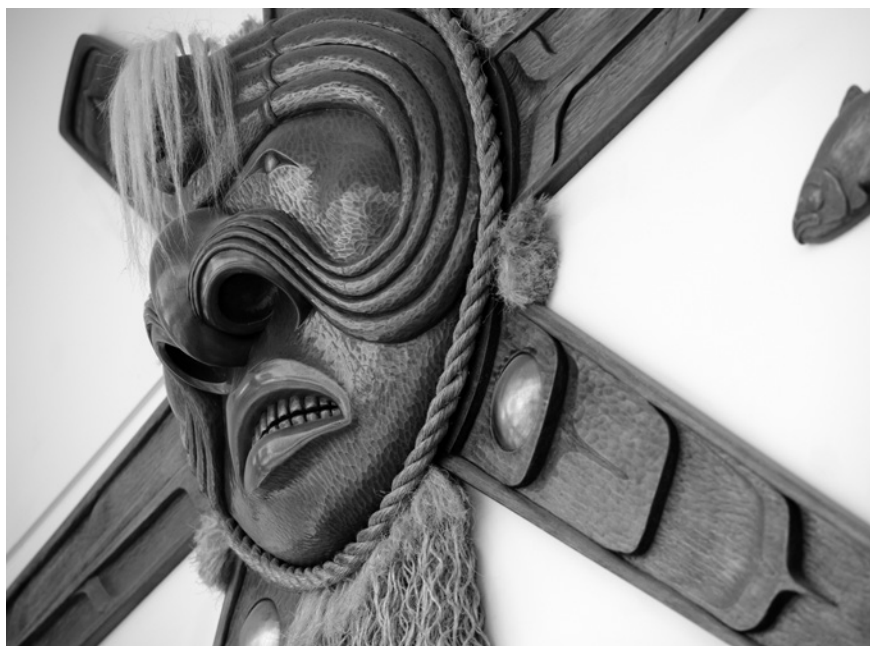
Phil Ashbee's work in the lobby continues to impress visitors.