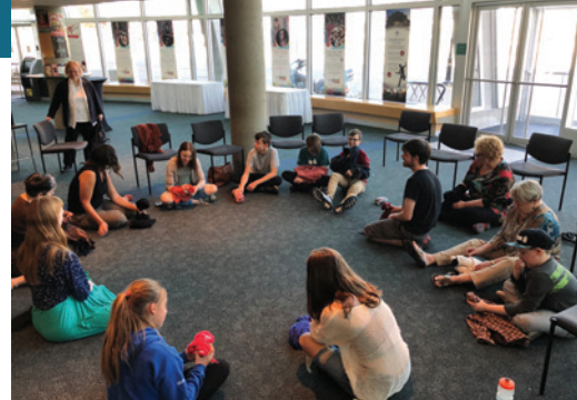
Young people participate in the workshop before free youth event