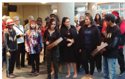
Kids from Kwumut Lelum welcome guests to the Midnight Shine event with drumming, singing and personal stories.