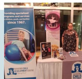
The Nanaimo Child Development Centre in the lobby at the Royal Winnipeg Ballet: Nutcracker.

Central Vancouver Island Multicultural Society | CHLY 101.7 FM | Crimson Coast Dance Society Gabriola Island Arts Council | Literacy Central Vancouver Island | Mid-island Metis Nation Nanaimo African Heritage Society | Nanaimo Arts Council | Nanaimo Child Development Centre Nanaimo Community Foundation | Nanaimo International Jazz Festival Association Nanaimo John Howard Society | Nanaimo Women's Resources Society | The Port Authority School District 68 | TheatreOne | Tillicum Lelum Aboriginal Friendship Centre Vancouver Island Short Film Festival | Vancouver Island Symphony | VIU Alumni Association VIU Theatre Department | VIU Visual Art Department