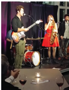
OFFstage Jazz event in the lobby.