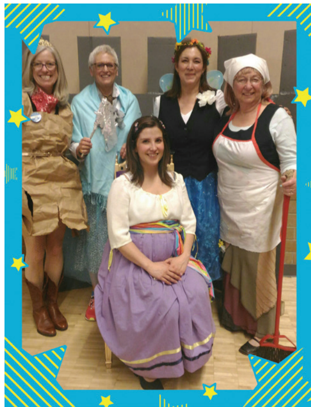
Our volunteers enjoy their day at the Volunteer Nanaimo Luncheon. The theme was nursery rhymes.

Total volunteer hours since 1998 opening: 282,480