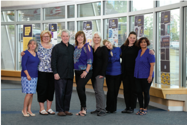
Ticket Centre staff make a great team.