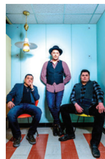
Midnight Shine, an up-and-coming band from Attawapiskat, rocks the house at the first show of our 20th anniversary season.

On September 9th, the 20th anniversary of The Port Theatre, Midnight Shine turned heads with a sound that seamlessly mixes roots, classic and modern rock with touches of Mushkegowuk Cree. Midnight Shine has been lighting up the music world all the way from Canada's Far North. Crafting a musical soundscape that gives a glimpse into their remote landscape, they continue to push musical boundaries and boldly take new strides, while staying true to who they are and where they come from. The Port Theatre Society continues to invite artists who further connect us to Canada's Indigenous communities and inspire local audiences.