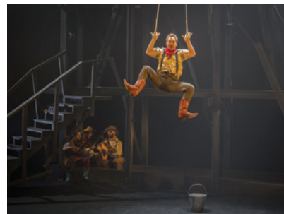
Cirque Éloize from Montreal excite the crowd with acrobatics and western-themed fun.

Nanaimo Disability Resource Centre Nanaimo Organization for the Vision Impaired (NOVI) Nanaimo Seniors Visiting Nanaimo Women's Centre NYSA- One Stop Youth Centre Open Minds Open Windows Society Pacifica Seniors Lodge Pamela's Home Society People for a Healthy Community on Gabriola Society Port Alberni Assoc. for Community Living Skaana Community Resources Ltd. Snuneymuxw First Nation Society of Organized Services SOS Seniors Supportive Apartment Living Tillicum Lelum - Urban Aboriginal Friendship Centre Tillicum Lelum - Men's Wellness Survivors VIHA- Mental Health and Addiction Services VIHA- Youth & Family Addiction Wesley Street Social Centre / V.I. Mental Health Soc. VI Vocational & Rehabilitation Services