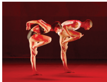
Contemporary dancers from world-leading choreographer Wayne McGregor showcase a hauntingly beautiful dance in Atomos.